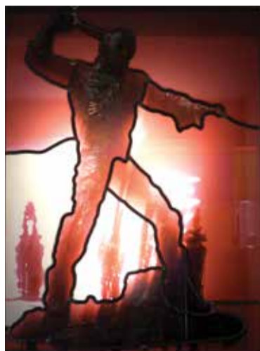
Les Innocents V5, 2007, glass, metal body, LEDs, 64 x 48 cm.

They wanted me to do only the sets without the costumes and without being in touch with the conductor. There was nothing for me to do really, as there was no global vision. However, there is a beautiful example of a truly global vision of these operas with Patrice Chéreau's Ring in Bayreuth from 1976, done in association with Pierre Boulez. It was simply magnificent. Unfortunately, these days the system wants names – and nothing else. This does not interest me.