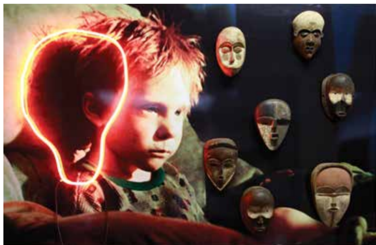
On the Breaking Bad's Wallpaper Between the Cry and the Masks, 2014, photograph mounted on aluminium, neon, six African masks, 144 x 235 cm.

AAN: Speaking of interactions with other disciplines, have you ever been tempted to collaborate with a theatre, or opera house, in order to