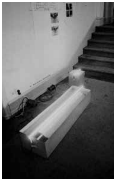
Sarkis' contribution to the exhibition 'When attitude becomes form' at the Berne Kunsthalle in 1969

exhibition When attitude becomes form at the Kunsthalle in Bern in 1969. Following that exhibition, I was more active abroad, as in France there had not been that open-mindedness or any interest in the anti-form movement. Therefore, I then mainly began exhibiting in Switzerland and Germany.