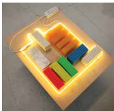
Mon atelier Villejuif en fluo, 2003, neon, pates a modeler, lead, wax and sur planche, with the drawing covered in Plexiglas, 16 x 66 57 cm.

not need an exhibition at the Venice Biennale. In addition, 2015 marks the anniversary of the genocide and I am of Armenian origin. I am taking all precautions to avoid any kind of polemic, because many people are wondering why I have been chosen for the Venice Biennale. I have to mention that the selection process for the Biennale has also been changed. Today, there is a foundation that deals with the various biennales (Istanbul Biennale, Venice Biennale, Music Festival in Istanbul, etc), which is independent from the government. The foundation chooses one curator and he is the one that selects the artist. This year, the process is different. Perhaps they may have been ashamed that a curator would select me? Consequently, they did the contrary – they set up a jury of five people that included the artist selected at the last Venice Biennale in 2013, two scholars from Turkey, and two scholars from abroad who are currently teaching in Turkey. The jury came up with one name: mine. And I would also be the one selecting my