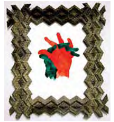
Ikon 43 after Matthias Grünewald, 9.11.1996

I tried to teach them that they had to create a conversation, a language within what they were doing. I asked them to do this not just on paper, but for real, in action. Everything comes from action. In my teaching, I have always been very direct. When I took