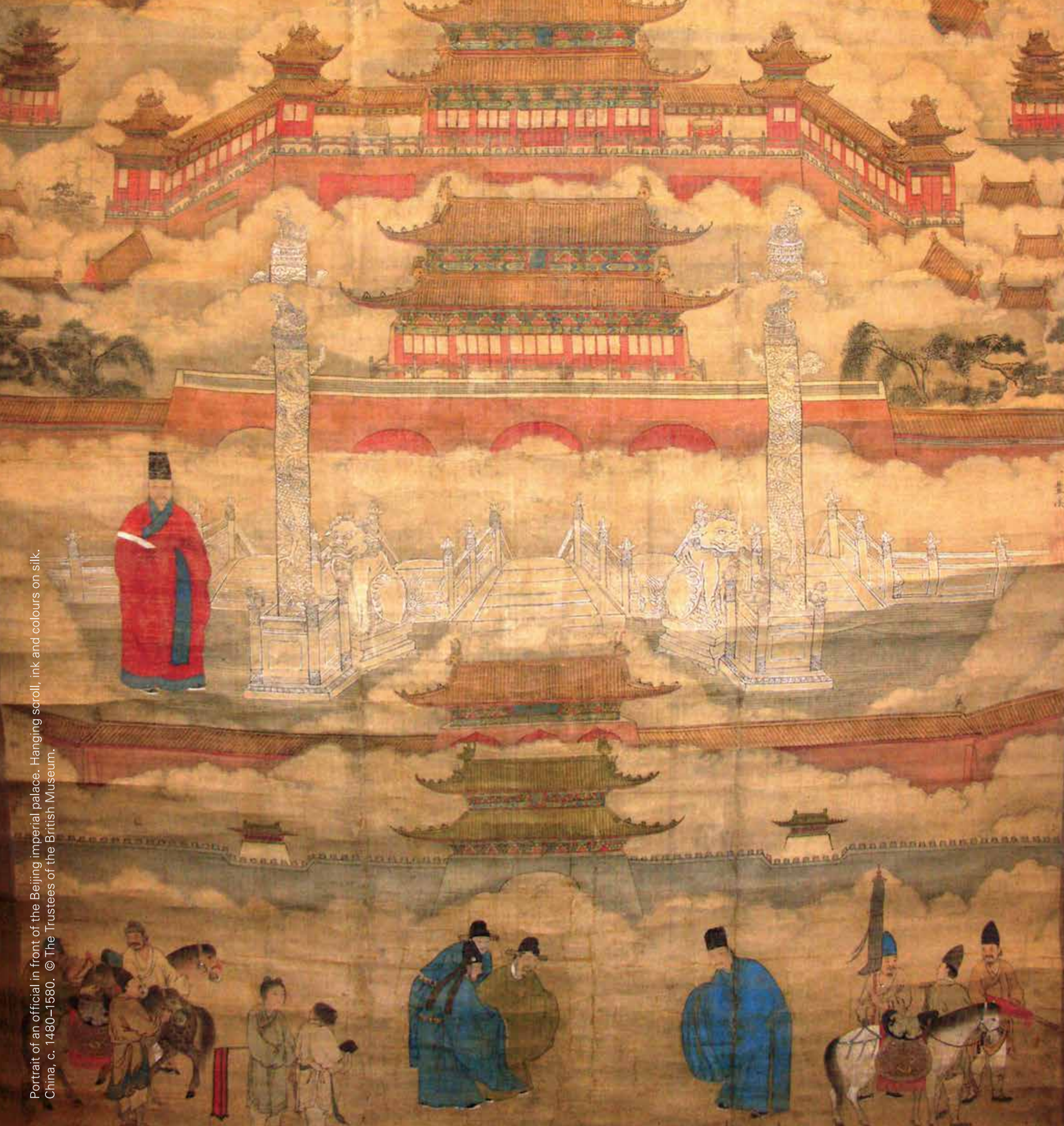
Portrait of an official in front of the Beijing imperial palace. Hanging scroll, ink and colours on silk, China, c. 1480–1580.